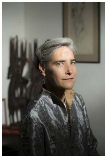
Sarah Chayes