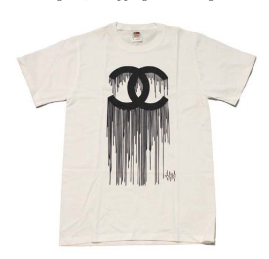
Figure 9: Dripping Chanel Logo<sup>28</sup>

Kong for Defacing Chanel Logo – Interview, ART RADAR ASIA (July 29, 2009), http://artradarjournal.com/2009/07/29/street-artist-zevs-detained-in-hong-kong-for-defacing-chanel-logo-interview. Zevs explains that he "kept working with the dripping effect throughout [his post-billboard] work because it conveys multiple meanings, and visually shows stark contrast and beautiful pattern and texture." Id.