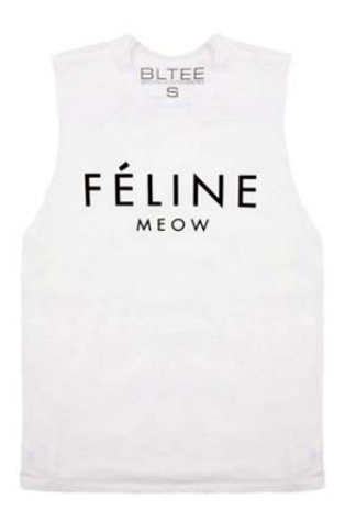
Figure 4: "Féline Meow"15

Any remaining possibility of a traditional "political agenda" on Lichtenberg's part was dashed by the next shirt I encountered: a "muscle tee" designed to evoke the logo of the high-end French fashion house Céline.