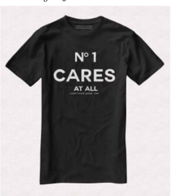
Figure 13: "N° 1 Cares at All"32

<sup>32</sup> No 1 Cares, IMNOTADESIGNER.COM, http://imnotadesigner.com/inadshop/index.php?route=product/product&path=65&product_id=187&sort=p.price&order=ASC (last visited Aug. 18, 2014). This shirt draws on the imagery of Chanel's well-known "No. 5" fragrance: