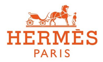
Figure 2: "Hermès Paris" Horse-and-Buggy Trademark<sup>4</sup>

Less clear, however, was the message the shirt sought to convey. Perhaps its designer wished to highlight the stark difference between the moneyed, old-world fantasy of Hermès and the less glamorous reality of South Central Los Angeles—home to the troubled City of Compton<sup>5</sup> and the birthplace of "gangsta rap." Instead of a dapper groom beside a horse-and-buggy, the individual depicted on the black and gold shirt stands beside what appears to be a broken-down truck. "Hermès" is displaced by "Homiés," with the accent preserved (though flipped) to reinforce the reference.