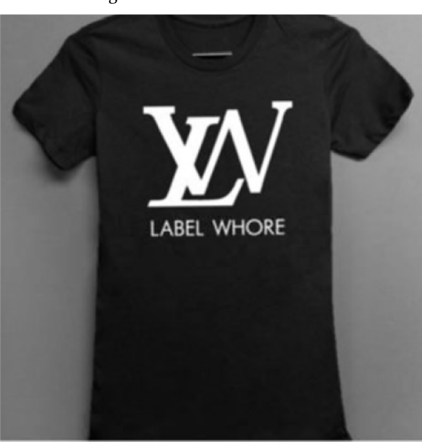
Figure 8: "LW Label Whore"26

Other works in my sample did not lend themselves to a single obvious interpretation (though outside sources might shed light on the context or purpose of these items)<sup>27</sup>: