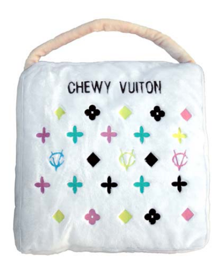
Figure 17: Haute Diggity Dog's "Chewy Vuiton" Chew Toy<sup>133</sup>

In a surprisingly brief and entirely citationless analysis, the Fourth Circuit wrote: