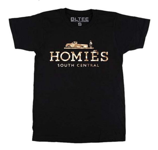
Figure 1: "Homiés South Central" 3

While riding the New York City subway late last year, I noticed an unusual shirt: