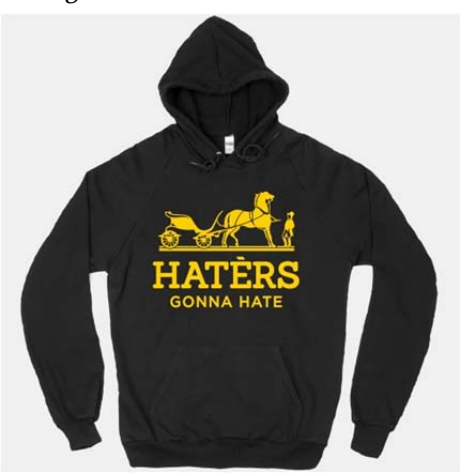
Figure 11: "Tribute to Mrs. Vuitton"30