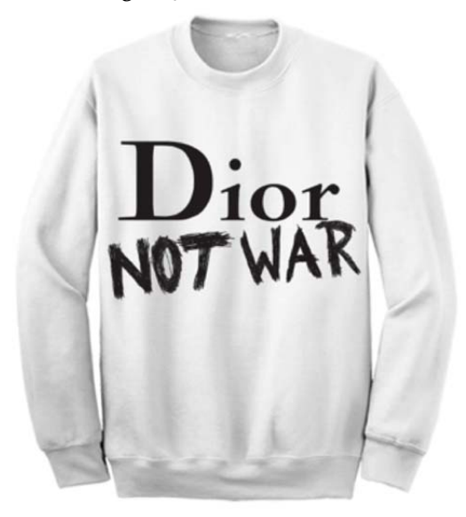
Figure 5: "Dior Not War"23

Limiting my examination to goods that transcended "knockoff" status, I chose a cross-section of Lichtenberg-esque works and tentatively classified them based on apparent ease of interpretation. In a few instances (where the visual material consisted mostly of words), I was reasonably confident that I understood what the shirt was trying to "say":