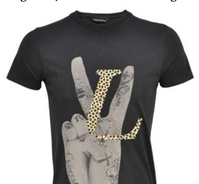
Figure 14: "LV" with Peace Sign<sup>33</sup>