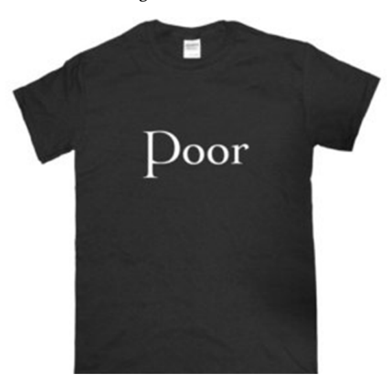
Figure 6: "Poor"<sup>24</sup>