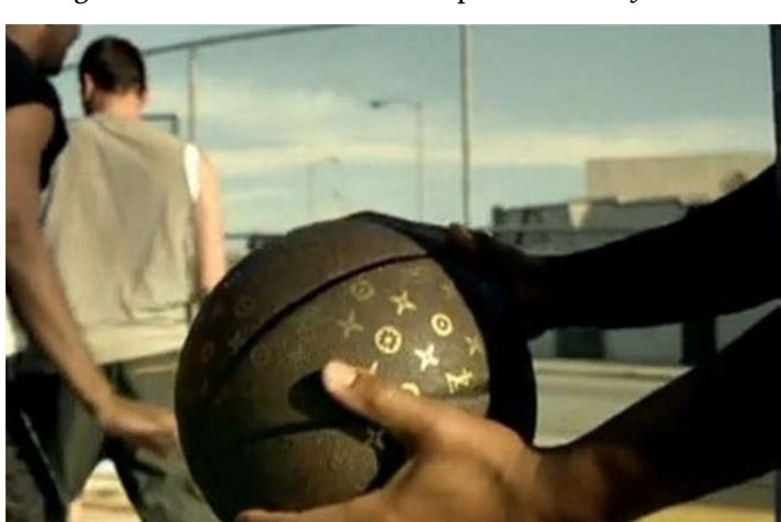
Figure 18: Still of Commercial Clip at Issue in Hyundai<sup>145</sup>

commercial aired during the Super Bowl that "included a one-second shot of a basketball decorated with a distinctive pattern resembling the famous trademarks of plaintiff Louis Vuitton." <sup>144</sup>