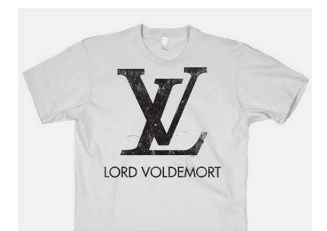
Figure 12: "Lord Voldemort"31

Still other products, like the Homiés shirt whose ambiguity had first piqued my curiosity, could potentially be read in a certain way, but at the now-obvious risk of substituting one's own assumptions and biases for the creators' intentions: