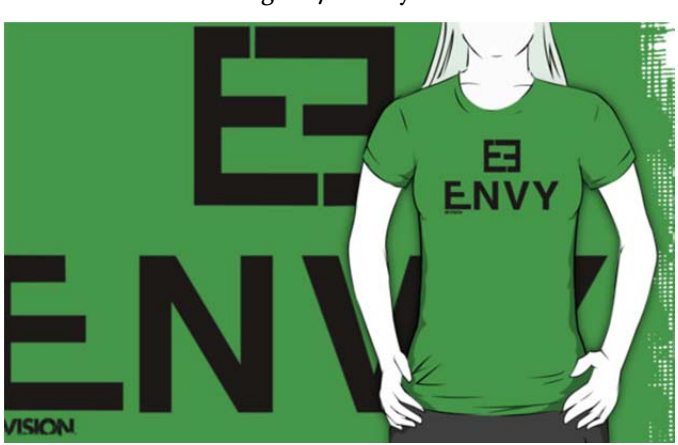
Figure 7: "Envy"25