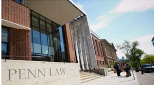
EJF Auction raises $85,000 for grants to students pursuing public interest work