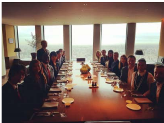
Global Research Seminar travels to Japan to explore judicial review