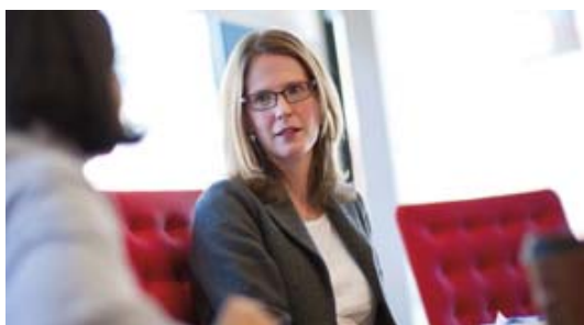
Children's Hospital of Philadelphia Announces Expansion of Multi-Partner Medical Legal Partnership