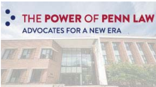
Campaign Kickoff: Explore Penn Law's vision for advancing 21st century legal education