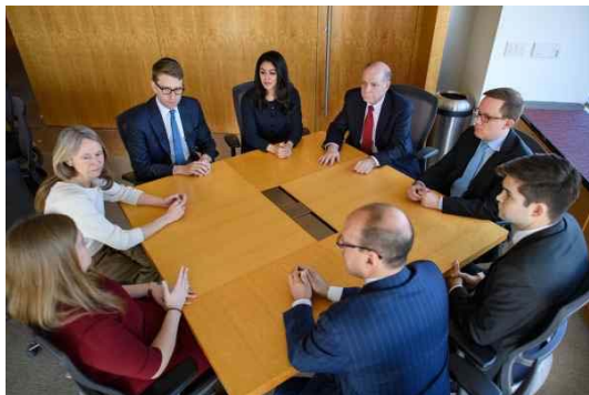
Penn Law students argue in front of Third Circuit in externship