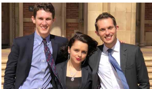
Penn Law team wins Williams Institute Moot Court Competition