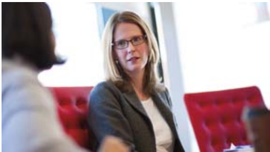
Children's Hospital of Philadelphia Announces Expansion of Multi-Partner Medical Legal Partnership