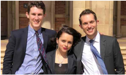
Penn Law team wins Williams Institute Moot Court Competition