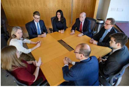
Penn Law students argue in front of Third Circuit in externship