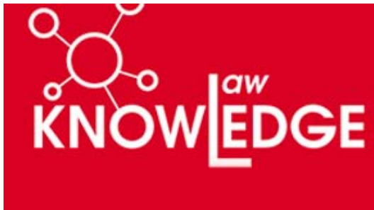
Read the Fall 2017 Cross-Disciplinary Newsletter