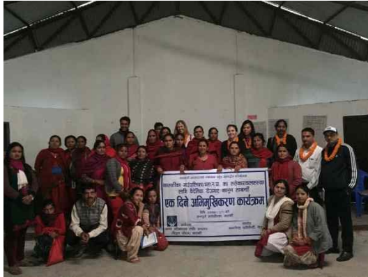
Learning from every client: Penn Law's Transnational Legal Clinic