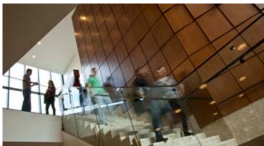
Center on Professionalism readies students for their legal careers