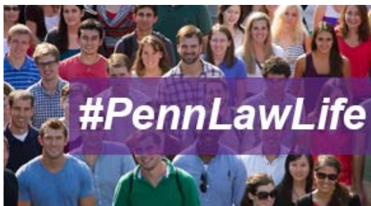
Follow along with the latest in life at Penn Law by following us on social media!