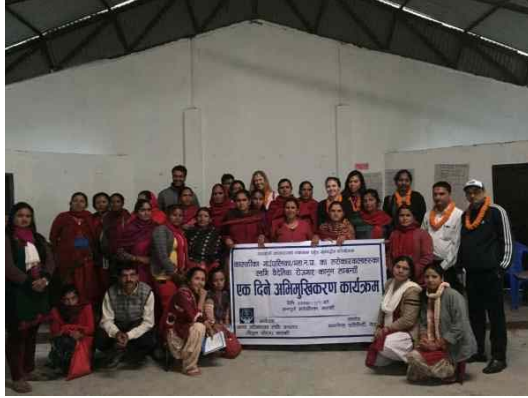
Learning from every client: Penn Law's Transnational Legal Clinic