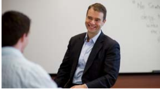
Op-ed from Tobias Barrington Wolff addresses anti-trans bathroom bills