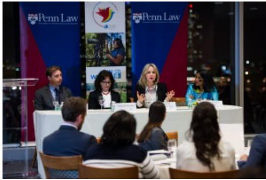
Penn Law and UN Women co-host high-level panel on gender equality and the law at United Nations HQ