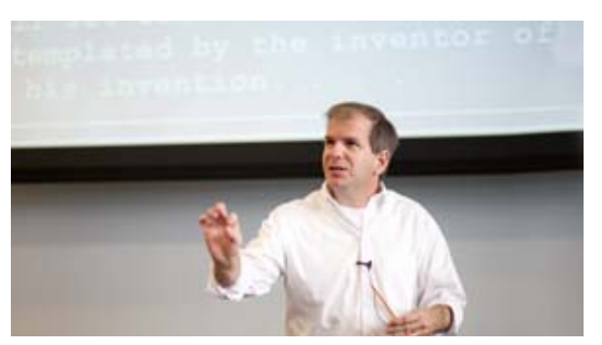
Penn Law brings IP law expertise to the world with free online course