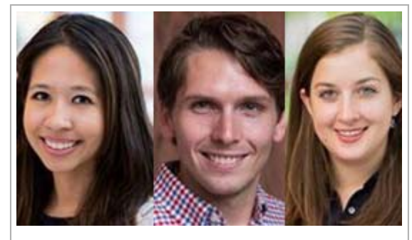
Law and Technology Students awarded scholarships for cross-disciplinary study at Penn Engineering Read More